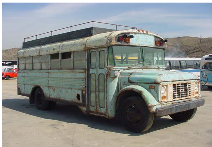
Gambler’s transportation from the Casino to Home

Over time, many recovering gamblers are particularly friendly, generous, and quite willing to “carry the