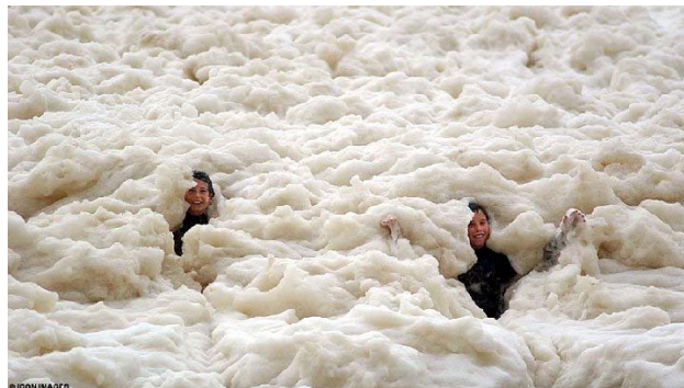
Children play among all the foam which has been whipped up by cyclonic conditions.