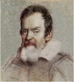
Galileo Galilei (1564 –1642)

Phila. Assoc. for Critical Thinking 639 W. Ellet Street Philadelphia, PA 19119