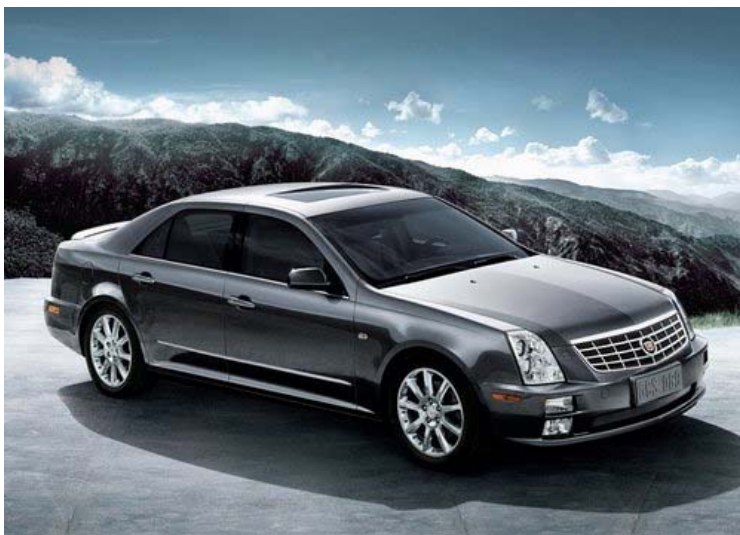
Gambler’s transportation from Home to the Casino

I have often heard this capricious phrase from clients in the early stages of recovery: “I don’t know how I ended up there; my car must have driven itself to the casino!” Denying the power of the obsession/addiction often leads the problem gambler to almost believe their vehi-